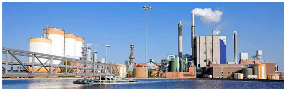
PRODUCTION SITE – FRÖVI MILL

This is an Environmental Product Declaration for CrownBoard Craft, registered in the International EPD System ( www.environdec.com ). The declaration has been developed based on the results of a Life Cycle Assessment (LCA) and the Product Category Rules for Processed paper and paperboard 2010:14 version 2.11 of 2020-01-29 (UN CPC 3214). Information and data given in this EPD can be used as upstream data by a customer who will perform a new EPD within the system boundaries given in a related PCR.