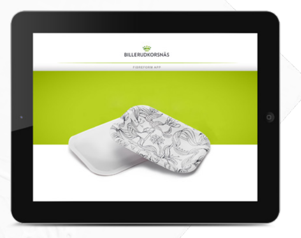
Want to experience our FibreForm app? Contact your local BillerudKorsnäs representative for a demonstration.

Structural design and knowledge-driven innovation that support new formable solutions. Focus on performance, food safety, brand expression and minimising material.